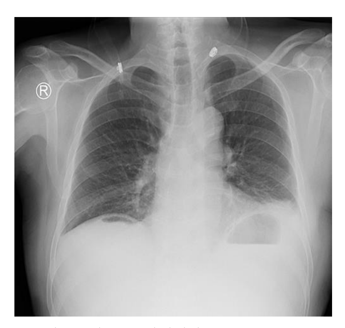
Figure 1: chest X-ray showing air under the diaphragm