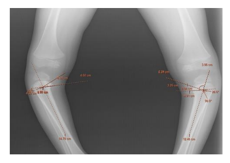
Figure 2 : weight-bearing radiographs of lower limbs showing medial intorsion of bilateral tibia with metaphyseo-diaphysial angle to be 25° on the right side and 20° on the left side