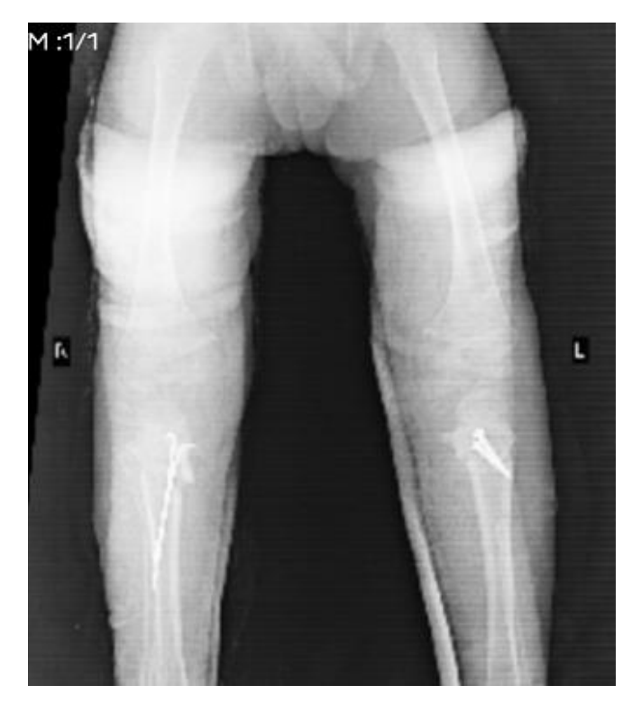
Figure 4 : post-operation radiograph showing significant correction in bowing of legs