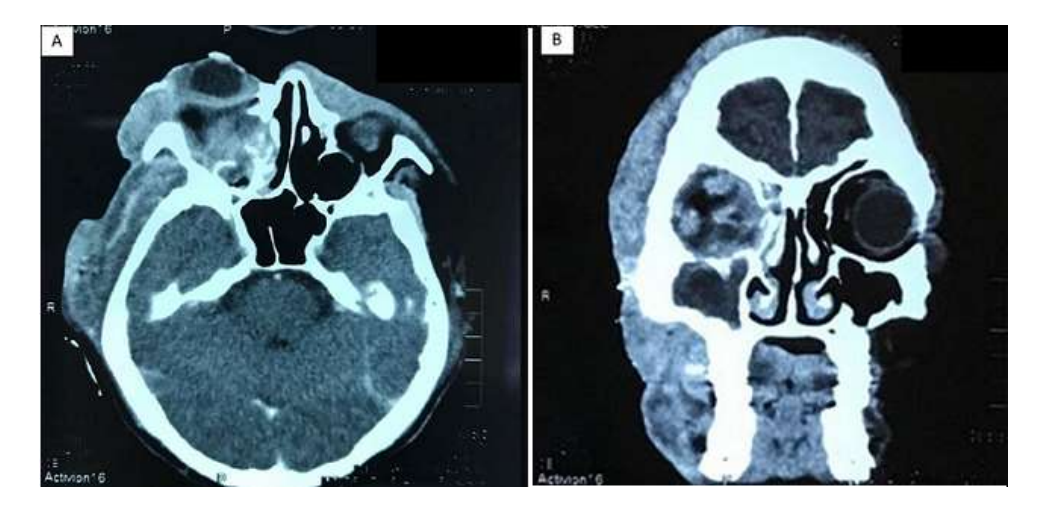
Figure 2: A) head CT scan with contrast, axial slice showed proptosis of the right eye 2.9 cm from interzygomatic line; solid mass was seen in the right retrobulbar, filling intraconal and extraconal area, with heterogenous contrast enhancement; this mass initially raising suspicion of malignancy; B) coronal slices showed thickening of the right extraocular muscles indicating chronic myositis