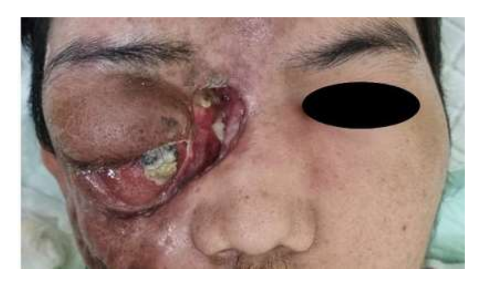
Figure 1: a-22-year-old male with two big ulcers at the right medial canthus and right periauricular area; multiple fistulas present at right zygomatic and maxillary area; severe proptosis with prolapse of ocular content was observed on the right eye