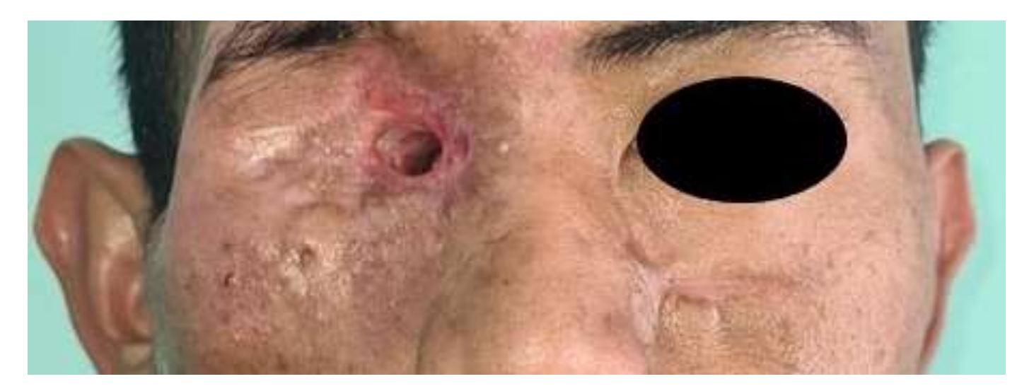
Figure 5: follow-up six months after treatment; the exenterated socket has epithelialized, but the fistula to the maxillary sinus is still present; an orbital prosthesis has been proposed and will be implemented in the near future