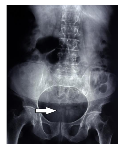
Figure 1 : multiple opacities in the vesical area