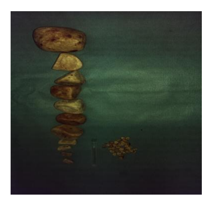
Figure 3: large stones after their extraction from the neobladder