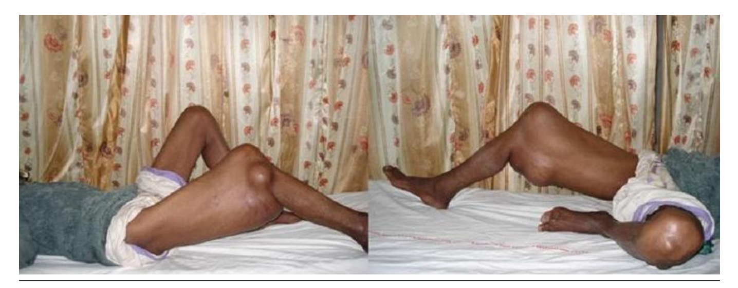
Figure 1 Clinical photograph showing massive swelling of right thigh, mimicking a soft tissue tumor