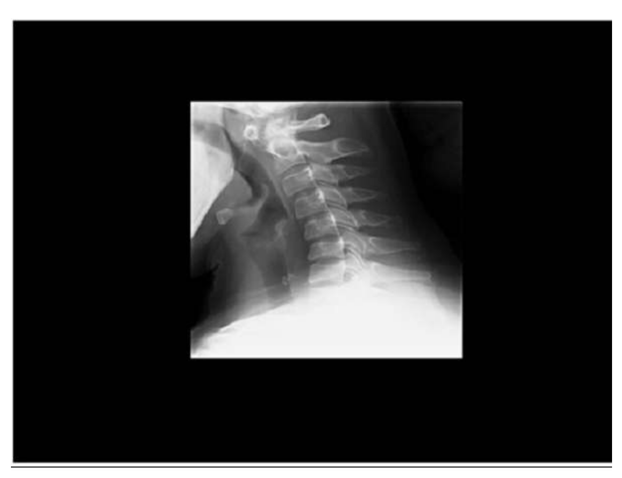
Figure 1 A lateral view of cervical spine radiograph showed an atloïdo-axoidien diastasis of 04 mm