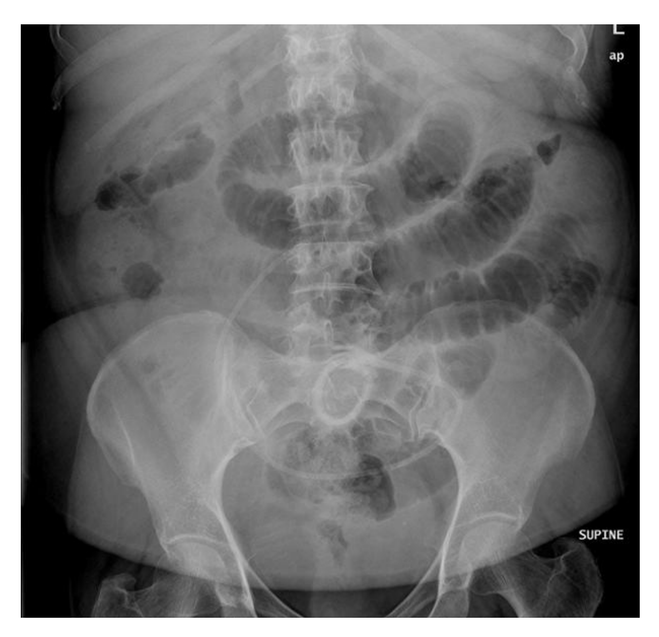
Figure 2: Supine abdomen X-Ray showed small bowel dilatation and ectopic lower abdominal position of gastric band.