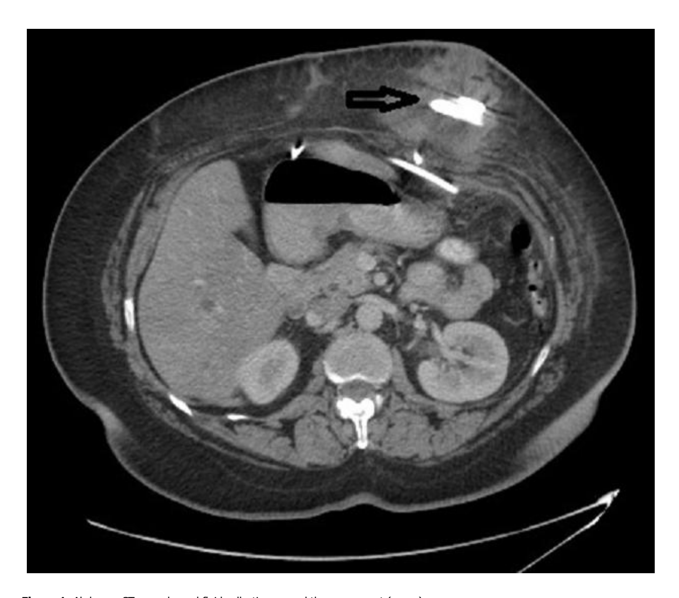
Figure 1: Abdomen CT scan showed fluid collection around the access-port (arrow)