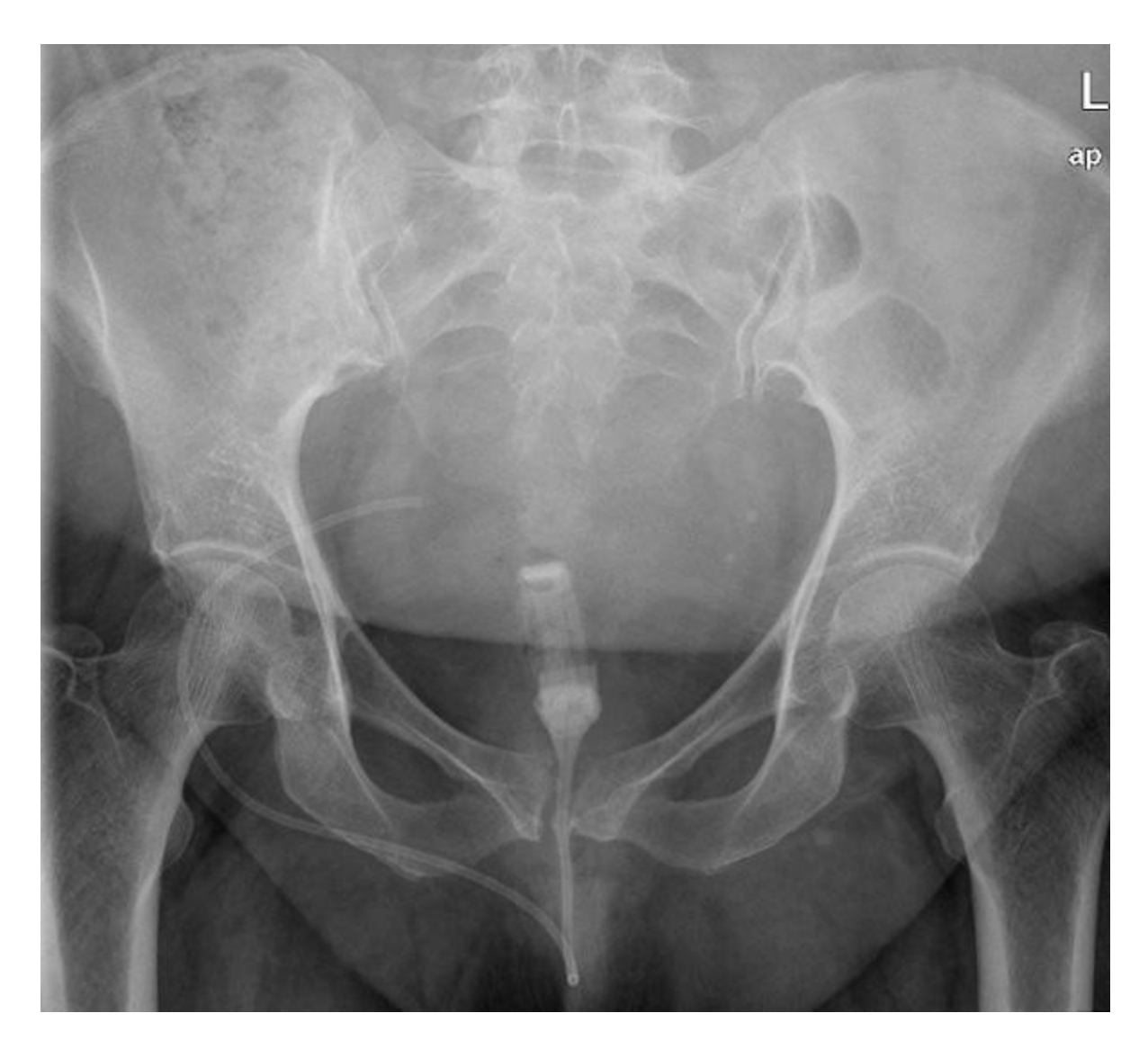
Figure 4: Pelvic X-RAY hours after the CT showed the gastric band and its connecting tube in the lower pelvis