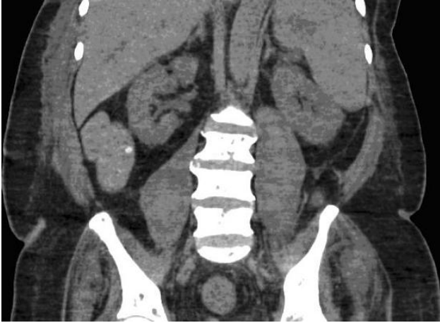
Figure 3: nonenhanced CT scan examination showed heterogeneous organized collections identified along the right and left psoas muscles causing focal contour bulge representing hematoma