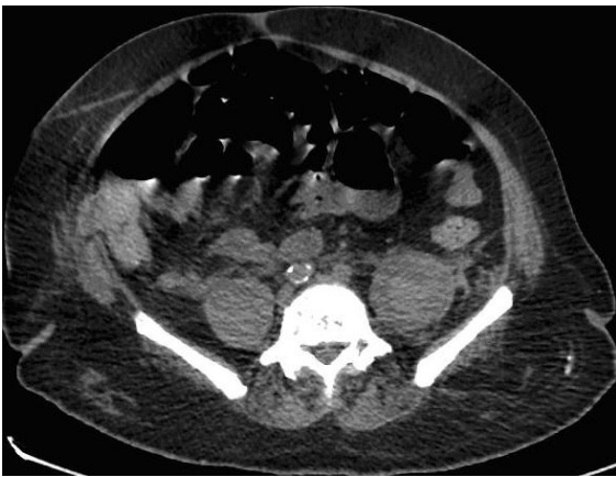
Figure 4: nonenhanced CT scan examination showed heterogeneous organized collections identified along the right and left psoas muscles causing focal contour bulge representing haematoma, minimal fat stranding surrounding the psoas muscles, more significant on the left side