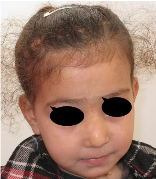
Figure 5: The same girl three years later