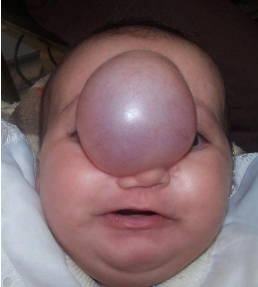
Figure 4: 50 days old girl with front-nasal meningo-encephalocele treated by combined approach