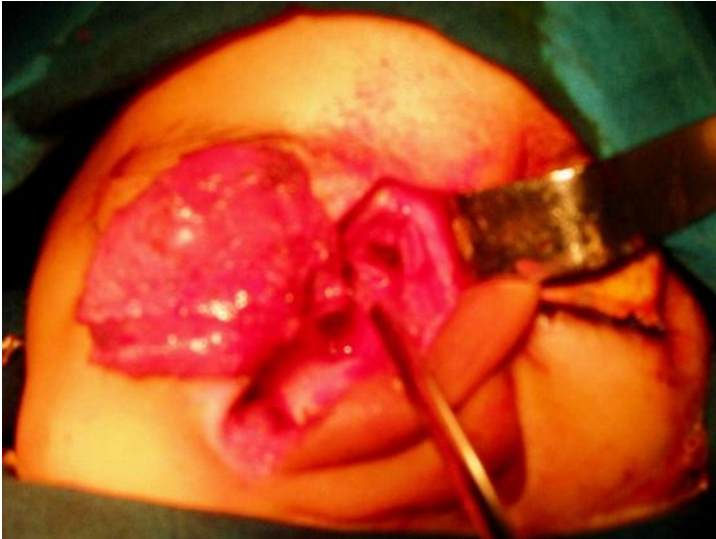
Figure 3: Facial approach for fronto-nasal meningoencephalocel