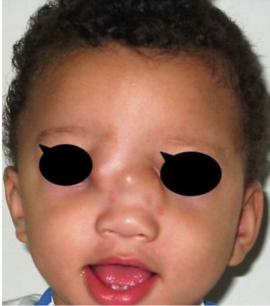
Figure 6: The 9 months old boy with fronto-nasal meningo-encephalocele operated first with cranial approach, and facial approach 6 years later