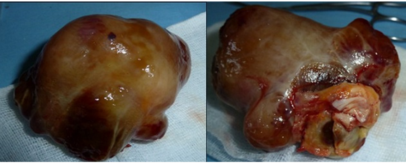
Figure 4: explanted tumor, a lobulated mass