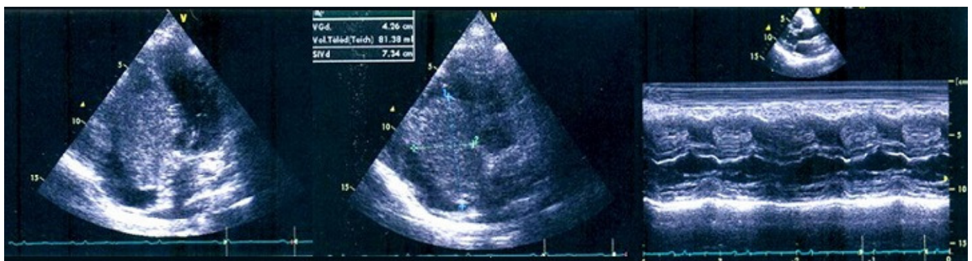
Figure 1: transthoracic echocardiogram: the four chambers and parasternal TM view showing the hyperechoic mass in the right atrium which was wide based and appended to the interatrial septum and prolapsing through the tricuspid valve