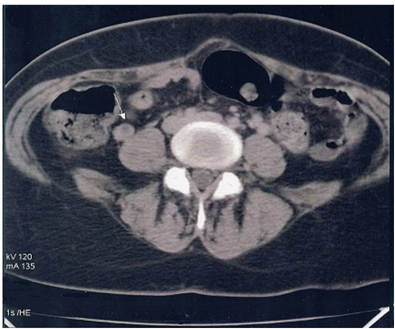
Figure 1: thrombosis of the right ovarian vein showed on spiral CT