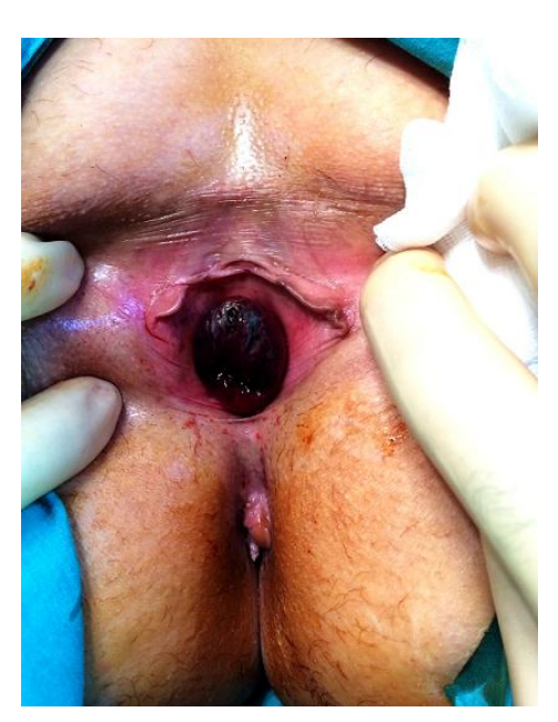
Figure 1 : Preoperative appearence of urethral hemangioma