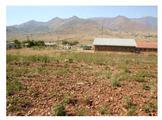
Photograph 5: October 2007