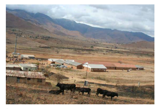
Photographs 1 and 2: Winter 2006 at the secondary school

What we describe in this article is another image that co-exists as reality with the realities referred to above. We present counter-illustrations of how teachers promote resilience in schools to balance numerous