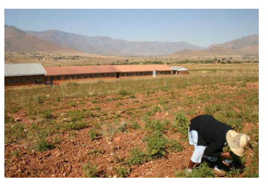
Photograph 4: May 2007