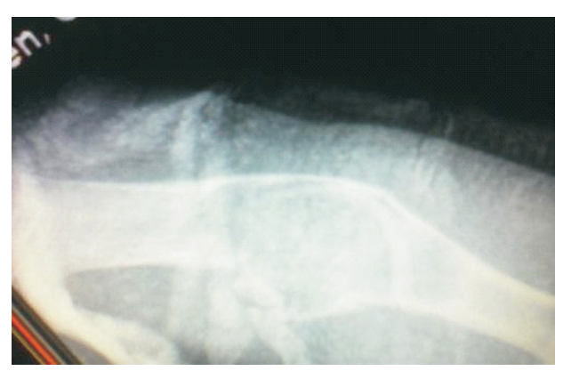
Figure 1e: Post-operation X-ray showing regeneration