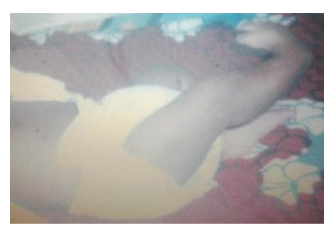
Figure 3a: Right tibia hemimelia