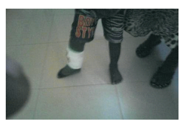
Figure 2c: Leg outside of scotch cast