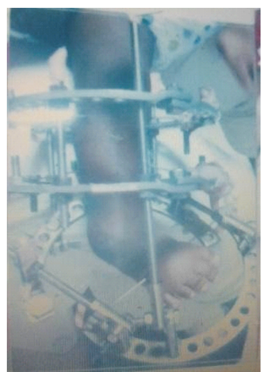
Figure 3b: Right leg and foot in Ilizarov device