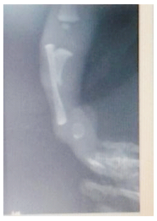
Figure 3c: Pre-op X-ray