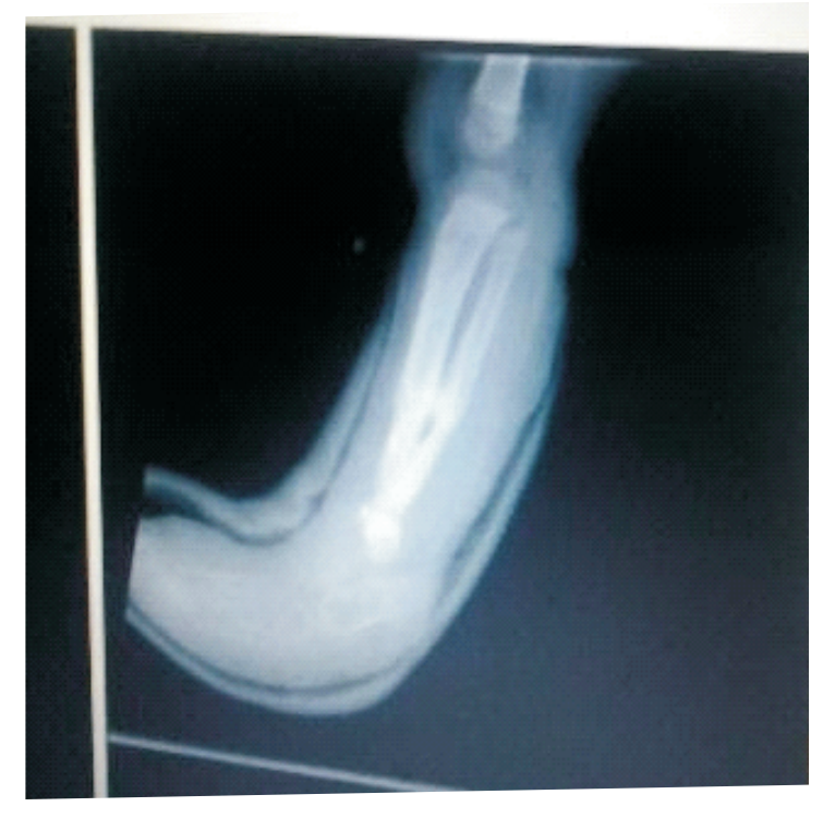
Figure 3e: Regenerated distal fibula