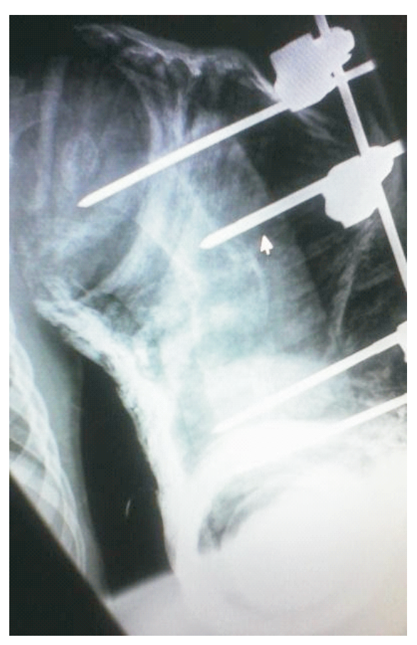
Figure 1b: Post excision biopsy with external fixator in situ