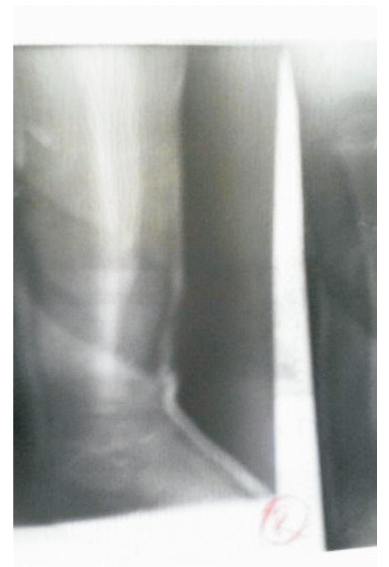
Figure 2a: X-ray showing missing distal labia