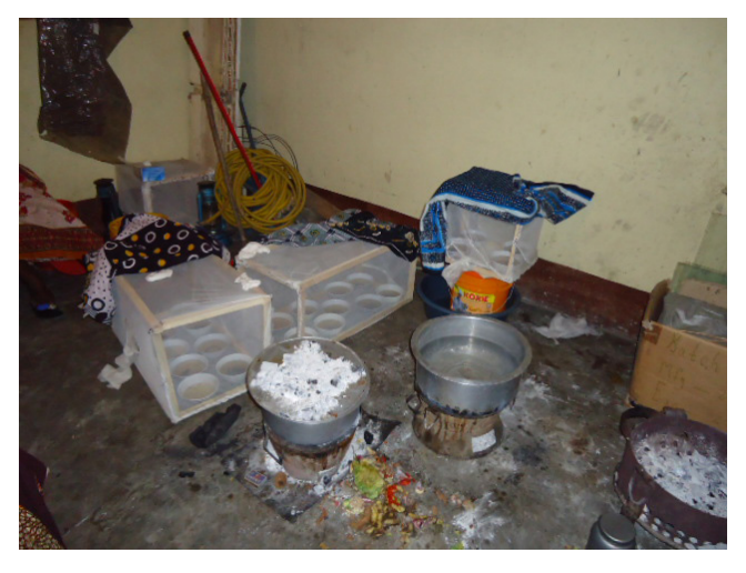
Figure 5. A - Mosquito cage preparation, B - Improvised insectary, room heater (charcoal stove), humidifier of wet Kanga and Vitenge, continuous boiling water to maintain humid air.

The emerged adult mosquitoes were fed on glucose solution in cotton wool prepared as per standard operating procedures (WHO, 1975). Because this study was conducted in the field where there was no insectary, an effort was made to prevent the emerged adult mosquitoes from being eaten by ants. For that purpose, ant control was achieved by using a basin full of water with a bucket in it (Figure 6). This bucket was filled with water too and covered to prevent it from floating. Sometimes we used a four-legged stool to hold a basin full of water as well. Then a mosquito cage was placed on the bucket with or without supporting bars depending on the size of the cage.