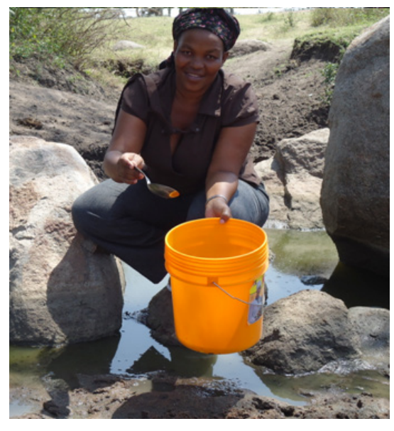
Figure 4. Larvae collection tool - a table ladle

In Bariadi district, in July and August,2012 the weather was cool and dry; hence we thought that optimal temperature and humidity for development of mosquitoes could not be attained without further input.