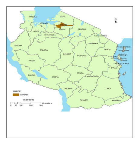
Figure 1. Map of Tanzania showing the Bariadi district

above sea level. It is a small town in the Simiyu region in Tanzania (Figure 1). The Bariadi community depends on livestock keeping and crop farming to earn their living.