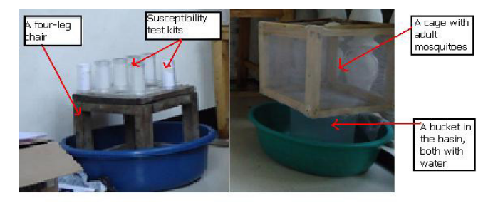
Figure 6. Mechanisms of ant control to prevent eating of mosquitoes