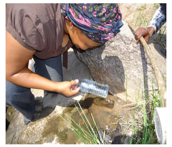
Figure 3. Larvae collection tools - an improvised empty plastic bottle