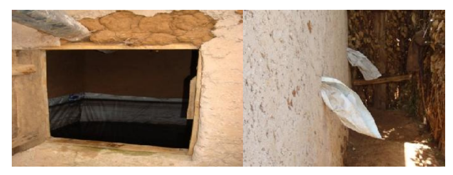
Figure 4.1 Small house to harvest water