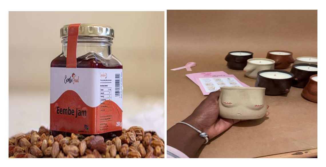
Figure 2: Dnak Eembe Jam<sup>2</sup>