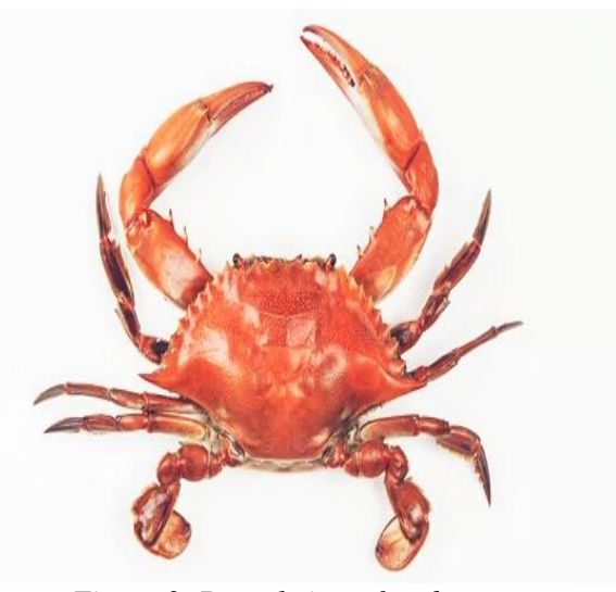
Figure 3: Dorsal view of crab