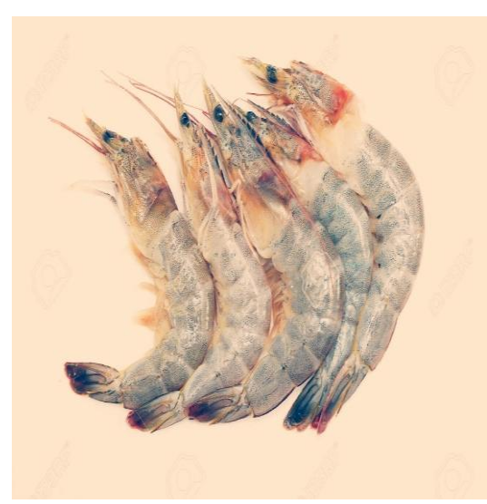
Figure 2: Prawn

ion in the mucus, which could not be completely removed from the gill lamellae before analysis (Ali and Fishar, 2005). factor Another that affects the concentration of heavy metals in aquatic organisms aside their feeding habit is the rate of adsorption through the outer layer of their skin which is known as dermal adsorption. Prawns are usually victims of heavy metal exposure through dermal adsorption (Shazili et. al., 2006). The environment contaminated with metals may first contact with the glycoprotein layer of the animal which is the mucus and then migrated to plasma membrane (Bull et. al., 1981). The metal toxicants may meet two major binding site; "physiologically inert sites" and "physiologically active site". In case of "physiologically inert site", the organism cell metabolism is not affected by the metal; however it is affected at the "physiologically active site" where the disruption of cell function may occur (Khail and Faragallah, 2008).