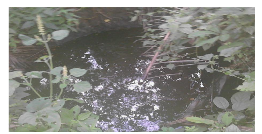
Fig. 4: Field photograph of stagnant water in the mining pit at Umualumaku localities. Magnifications X 50.

The Mass spectrometer was operated with electron impact energy of 70 eV and ion source temperature of 230 °C. The GC oven temperature was isothermal for 1min at 80 °C and then programmed from 80 to 280 °C at 3 oC/min and isothermal for 20 min at 280 °C. Individual saturated, aromatic and NSO- compounds were monitored by selected ion monitoring (SIM) at a cycle time of 1s.The GC-MS data were acquired and processed with a Hewlett-Packard Chemstation data system.