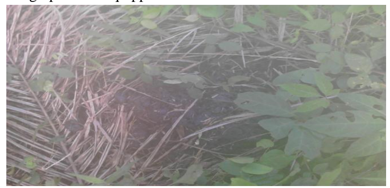
Fig. 3: Field photograph of oil shale outcrops at Umualumaku localities. Magnifications X 50

DB-5 MS fused silica capillary column (30 m x 0.25 mm) and helium was used as carrier gas with a flow rate of 1ml/min.