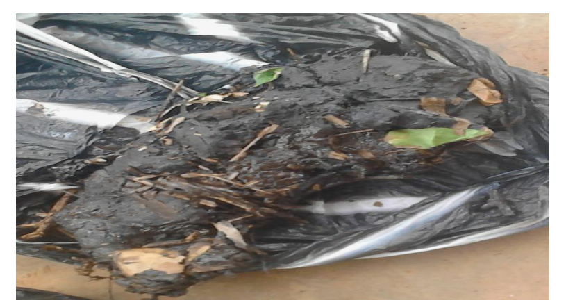
Fig. 2: Field photograph of oil shale outcrops at Umuezeala Nsu. Magnifications X 50

Soil and oil shale tailing samples were analyzed for polycyclic aromatic hydrocarbons (PAHs) according to USEPA Method 625 (USEPA, 1979). The samples were freeze dried, then serially extracted with methylene chloride; the extracts were dried, concentrated and analyzed by GC/MS (HP5890GC/5972MS).