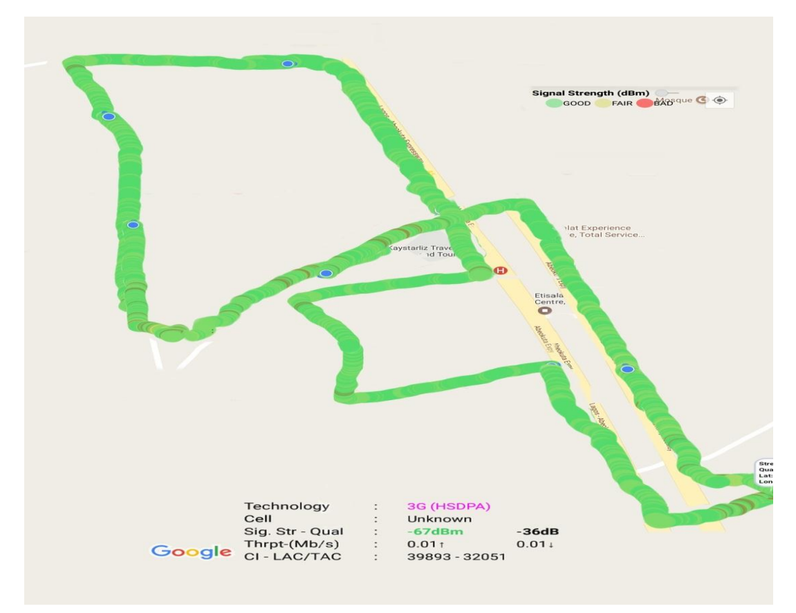
Fig 5: Received signal level for MTN along drive test route.