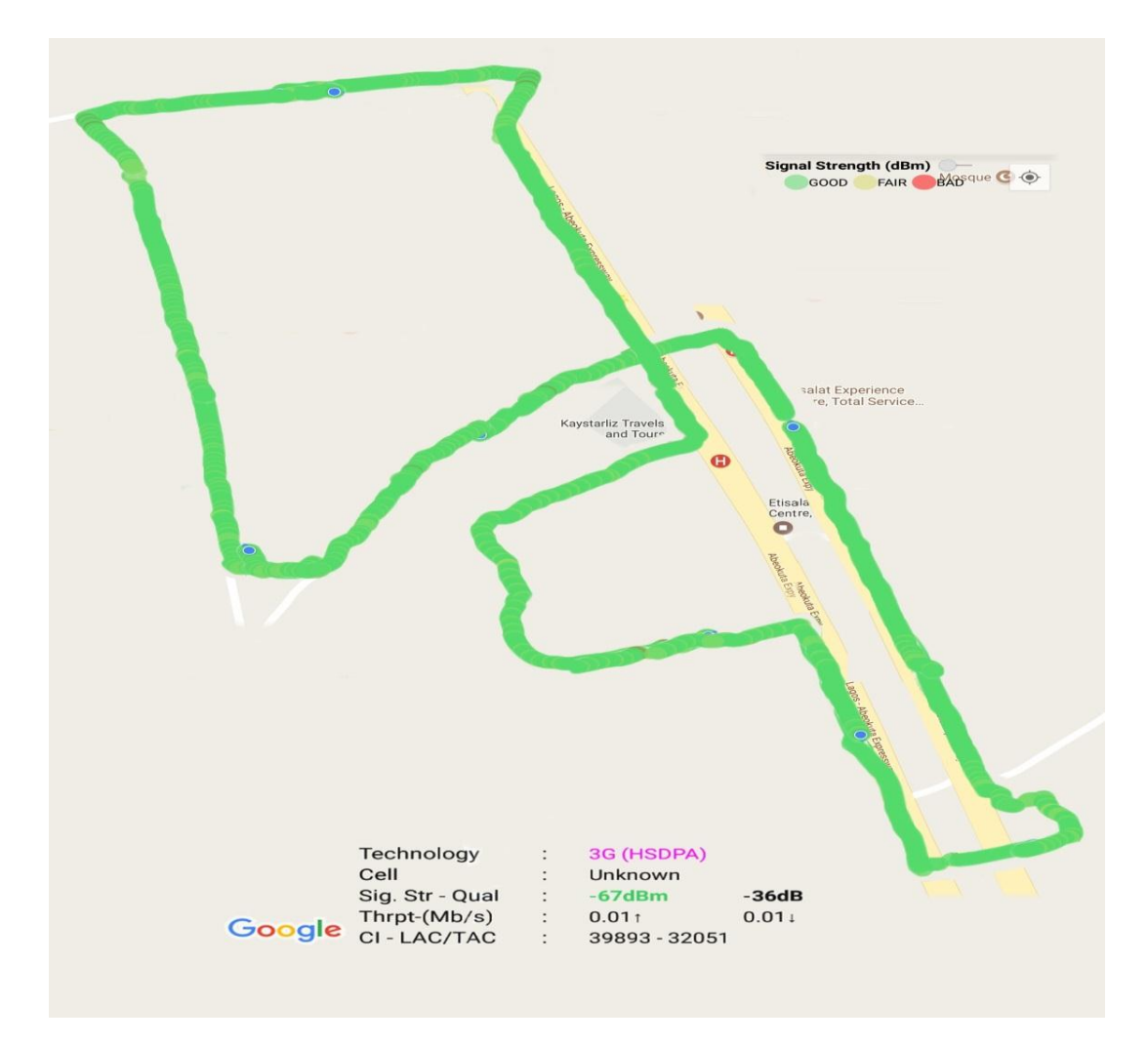
Fig 6: Received signal level for AIRTEL along drive test route