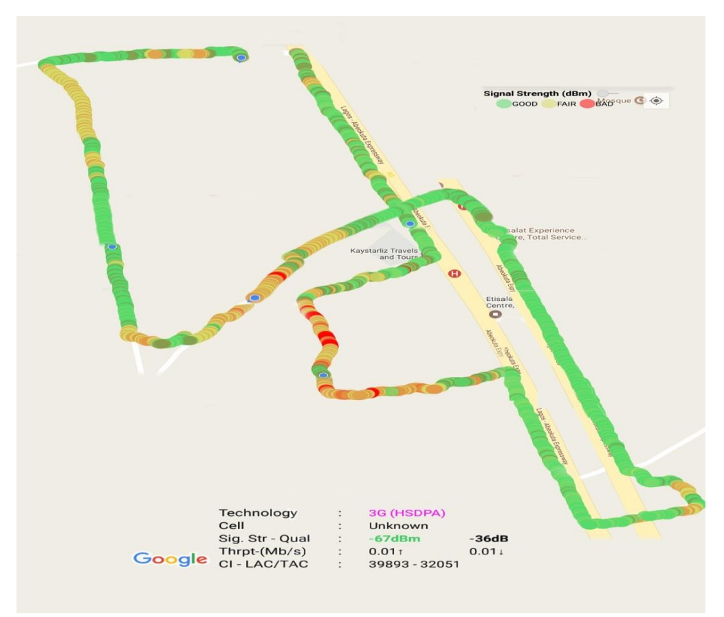
Fig 4: Received signal level for Etisalat (9mobile) along drive test route.