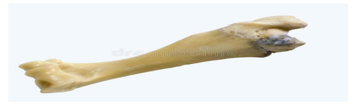
Figure 2: Femur bone of cow (Bos taurus)

The aim of this study therefore is to determine the impacts of functional groups on the intermolecular forces of attraction within the molecules of animal glue obtained from the femur bone of cow (Bos taurus) which ultimately determines its adhesive strength. The bones of Mammalia have proven to be one of the sources of animal glue in the past. An in-depth knowledge of these functional groups will be useful in simulating the use of other organic and inorganic materials as adhesives. Figure 2 shows the Femur bone of Cow (Bos taurus).