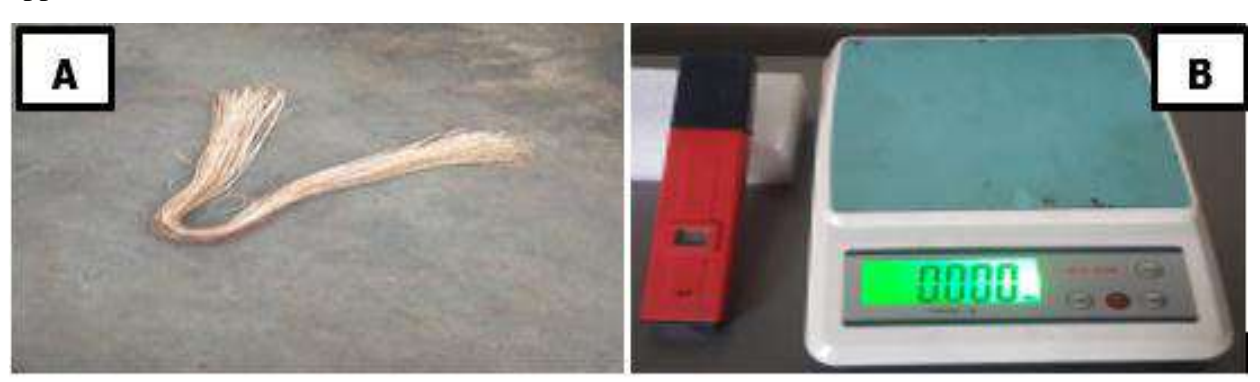
Figure 1: (A) Extracted Rafia palm fibre (B) Digital weighing balance and pH used

The materials used are raffia palm, pH meter and electronic weighing scale as shown in Figure 1. Other apparatus used in extraction and treatment include: Electric oven, graduated cylinder, plastic bucket, plastic cup, glass beaker, distilled water etc.