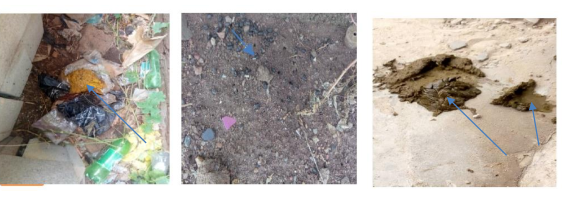
Fig 2: Feces of a human

drop of the mixture was placed on a clean glass slide using a clean pipette. A cover slip was placed on the mount and placed under a microscope with the objective lens set at 10x to search thoroughly for parasites. The identification of the oocysts/eggs/larvae were done based on their characteristic morphology with the aid of Cheeseborough (1998) and Soulsby (1982).