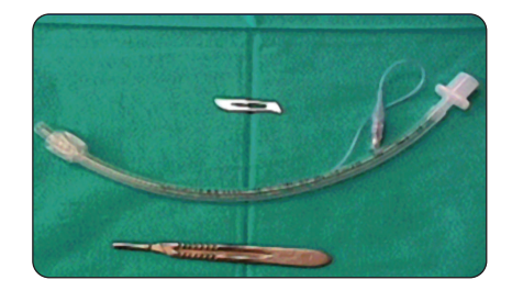
Figure 4: Simple equipment needed to perform a cricothyroidotomy : 1 - A no. 20 blade. 2 - A no 6.5 cuffed endotracheal tube. 3 - A scalpel handle.

The minimum equipment needed to perform this procedure is illustrated in Figure 4.