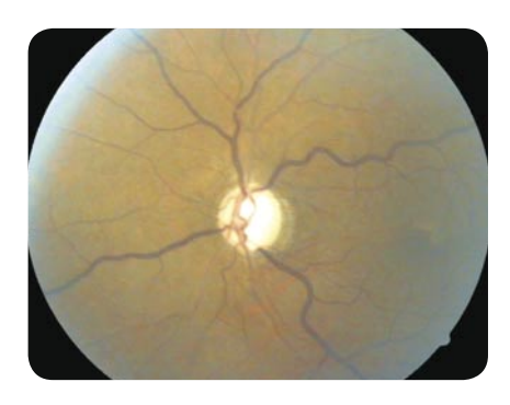
Advanced cupping (0.9)-note pallor of disc and barely discernible rim shown by veins dipping backwards over rim.

Most glaucoma is detected by optometrists, who usually screen intraocular pressure with an air-puff tonometer as a routine part of their examination, or it is detected in individuals who have been identified as at risk due to a family history and are being monitored. These patients would usually then be referred to an ophthalmologist, who would follow them up and initiate treatment if and when required. The air-puff tonometer tends to overestimate the intraocular pressure, particularly in patients with a strong blink reflex. It is important to remember that the majority of patients with a raised intraocular pressure (above 20 but less than 30) will not go on to develop glaucoma and are referred to as ocular hypertensives. They are at increased risk of glaucoma, however, and usually require lifelong follow up. Contrary to popular belief, most forms of glaucoma are not associated with headache and the vast majority of patients are totally free of any symptoms of a higher than normal intraocular pressure, except in the case of a sudden rise in pressure as occurs in an attack of angle-closure glaucoma (see box 2).