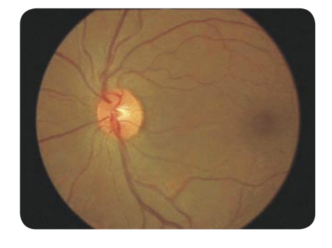
Figure 1: Progressive optic disc cupping

Normal disc with healthy rim. Cup: disc ratio of approximately 0.2