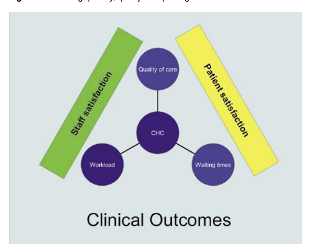
Figure 2: Balancing quantity, quality and queuing

CHCs consciously struggled and experimented with the balancing of the workload, quality of care and waiting times (see Figure 2).