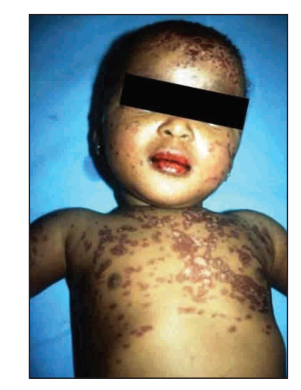
Figure 6: Child with Stevens-Johnson syndrome due to amoxicillin. Note mucosal involvement

Patients with Stevens-Johnson syndrome should ideally be admitted in hospital. Attention should be paid to maintenance of fluid and electrolyte