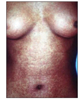
Figure 1: Maculopapular rash due to amoxicillin

and a short course of systemic steroids may be helpful. Topical steroids and emollients should be applied. Antihistamines should be added to relieve pruritus.