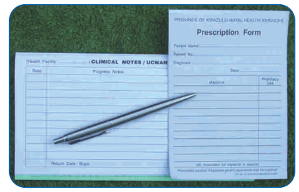
Figure 4: The Prescription Form

3. A framework for the monitoring and evaluation of the implementation of the PHR system was designed: A set of norms and standards was developed against which to measure a PHR, some of which were based on the COHSASA (Council for Health