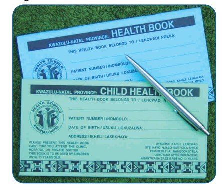
Figure 3: The Health Books

1. Design of a better PHR: The team discussed what the ideal PHR would look like: Size - 10 x 21 cm; at least 32 pages for clinical notes; the name - Health Book (see Figure 3); details in Zulu and English; a Problem List; pages for laboratory and X-ray results; and incorporation of the Health Card for Women, TB Card and Antenatal Card. Two books were eventually designed, one for