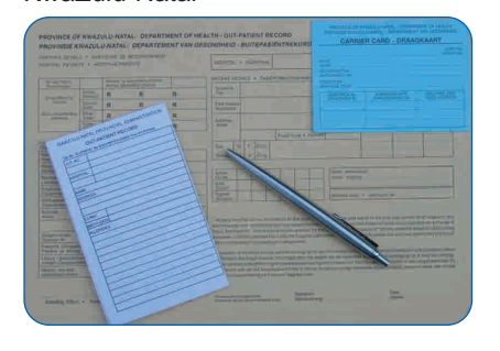
Figure 1. The FHR and PHR used in KwaZulu-Natal

The term "ambulatory records" refers to records that are used by outpatients as opposed to records used for admission to a hospital ward. Two basic types of ambulatory medical records are used throughout KwaZulu-Natal – the A4-sized Facility-held Record (FHR) and the small PHR (see Figure 1). They are both called "Outpatient Record". The FHRs are used only at that facility and are filed at the facility. The PHR is kept by the patient and can thus be used at any health facility.