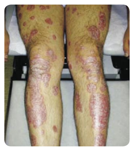
Figure 2. Classic silvery scale of a psoriasis plaque.