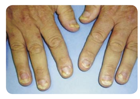
Figure 6. Nail pitting in a patient with psoriasis.