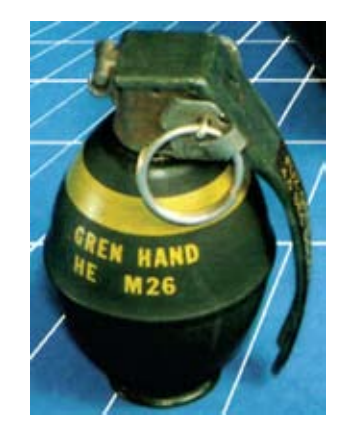
Figure 1: M26 hand grenade used

M26 hand grenades were designed to produce casualties through the high-velocity projection of fragments. The grenade is 113 mm in length with a diameter of 60 mm, and is filled with 160 g of high-energy composition B charge. The grenade, with a total weight of 465 g, produces approximately 1 000 small fragments weighing about 200 mg each. It has a