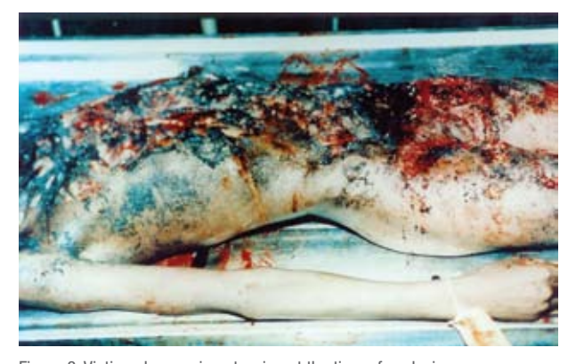
Figure 3: Victim who was in outer ring at the time of explosion

away had deep lacerations (Figure 3). The boys who were a considerable distance from the blast escaped with minor injuries. The lungs and intestines were diffusely contused in three boys who were a small distance from the explosion.