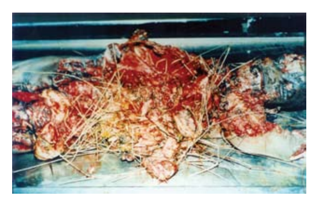
Figure 2: Victim who was in central ring at the time of explosion

At autopsy, all children had their ventral aspects mutilated or greatly lacerated. A bluish green substance was deposited all over their abdomens and chests. The abdomen and chest of the boy closest to the blast were mutilated (Figure 2), while those who were a little distance