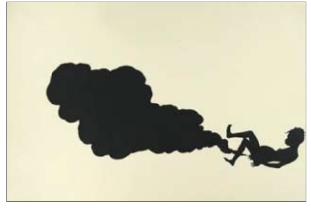
Figure 1: Kara Walker 'untitled' digital print 20069

Questionnaires were administered by trained personnel outside the three sites where the banners were displayed. Questionnaires were only administered in English as this is the medium used to teach at DUT. Informed consent was obtained from all participants prior to the interview process and the interviews were undertaken on a voluntary basis with confidentiality assured. The questionnaire included both closed and open-ended questions that assessed knowledge of EC, extent of use, traditional practices of EC, social and cultural acceptability of the use of EC, access to EC, current contraceptive practices as well as questions relating to the Kara Walker image. Demographics on age, gender, race, year of study and study interest were collected. Open-ended questions to solicit students' opinions on various issues regarding sexual health were included in the questionnaire. This study was approved by the Ethics Committee of the Faculty of Health Sciences, DUT.