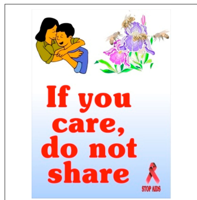
Fig. 1. The poster used in this study.

The poster selected for this study is presented in Fig. 1. It was one of 16 posters used in a previous study into the effects of rhetorical figures in HIV and AIDS messages among young South Africans (Lubinga et al. 2014). In that study, we observed that there was a very low general level of AC of the messages. We decided to choose a poster that scored relatively high on AC ( M = 2.36 , SD = 1.09 on a scale of 1–4), and also relatively high on reported willingness to discuss it among peers ( M = 3.37 , SD = 1.00 , on a scale of 1–4). The poster was in English because the results of a previous study conducted on the comprehension of puzzling messages in two African languages and English indicated that there were no differences in comprehension by participants on the basis of the message languages (Lubinga & Jansen 2011). The poster included the verbal message, 'If you care, do not share', plus a combination of pictures: a couple hugging, a single flower with several bees hovering over it, and a red ribbon underneath it with the text, 'Stop AIDS'. The intended message was that having sexual relations with more than one