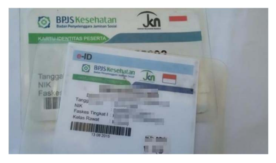
Figure 1. BPJS card that can cover treatment fee for HIV/AIDS and OI without complication.

Additionally, B1, B2, B3, and B5 always buy multivitamin to maintain their body stamina. They spend about IDR 70,000 - IDR 100,000 monthly. Meanwhile, B6 should buy formula milk monthly to fulfil her HIVinfected baby's nutrition, because she as PLWHA may not breastfeed her baby exclusively. A 900g-box of formula milk costs IDR 319,000.