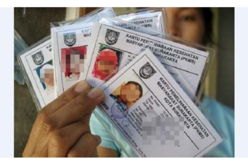
Figure 2. BKMKS card covering HIV/AIDS treatment fund particularly for poor people in Surakarta.

immunological or clinical failure. CD4 should be examined periodically to ascertain the treatment response. A2, C3, C4, C5, C6 and C7 argued that the largest laboratory cost is used for Viral Load, CD4, Rontgen, and liver function examination. However, B1, B2, B4 and B6 spend no fund for laboratory examination because of Surakarta City Government's policy supported by Global Fund-AIDS Tuberculosis and Malaria [GF-ATM] manifested into the NGO-caring about AIDS programme in Surakarta.