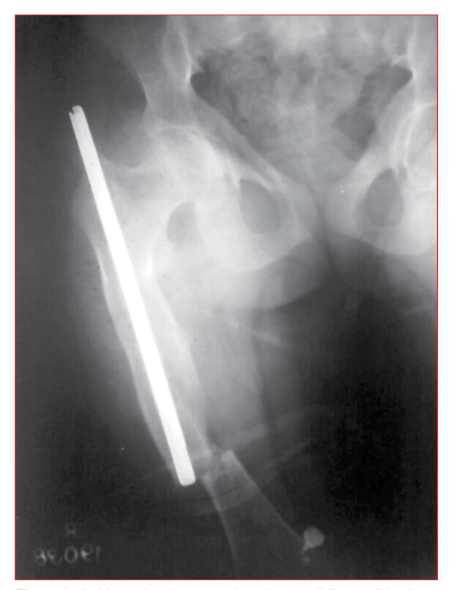
Figure 2: An X-ray showing a previous intramedullary nail in situ and the fractured femur

The preoperative laboratory investigations were normal. The results are shown in Table I. The preoperative electrocardiography, echocardiography, chest X-ray and coagulation profile were also normal. A pulmonary function test was suggestive of mild restrictive disease. Airway examination revealed a mouth opening of 3 cm (two fingerbreadths), Mallampati class III score, with a short neck and defective dentition. Neck flexion and extension were limited. The patient was accepted for surgery as an American Society of Anesthesiologists (ASA) grade III patient. In view of the anticipated difficult airway and normal coagulation results, it was decided to proceed with a regional spinal anaesthetic technique. Before anaesthesia