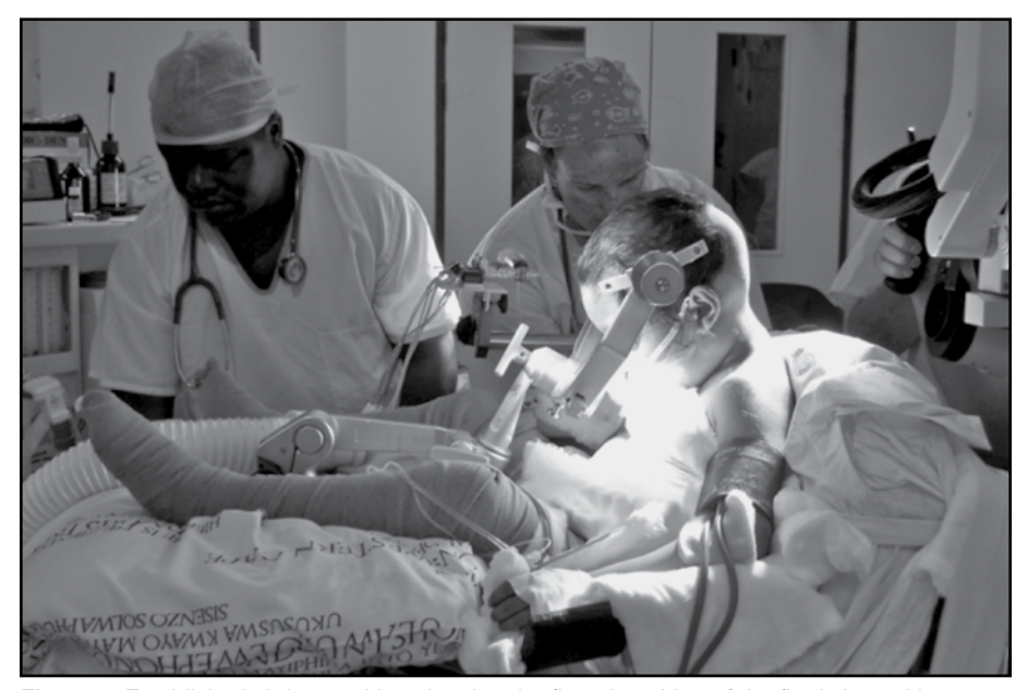
Figure 1 : Established sitting position showing the flexed position of the firmly bound legs, the neck in limited flexion and the supportive positioning of arms in "gutter"-type arm-rests in relation to the torso, as well as the pressure transducers at the level of the external auditory meatus. The surgeons can be seen positioning the microscope over the top end of the operating table.

In preparation for a significant venous air embolism (VAE), a 20 ml syringe was attached to the intra-atrial central venous