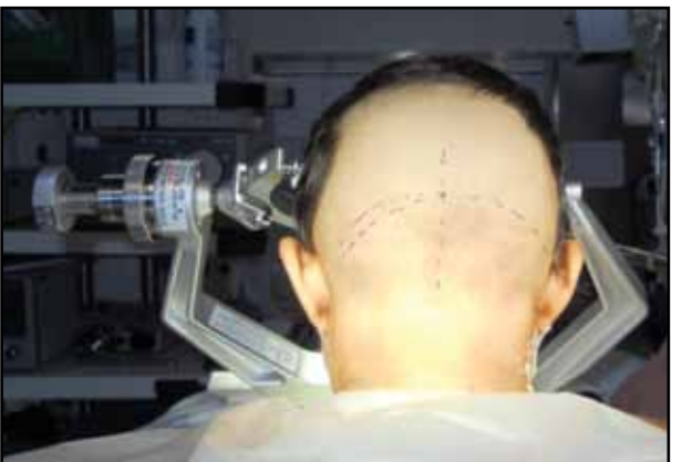
Figure 2: Surgical access before incision. The flexed neck will provide a horizontal plane beneath the tentorium, allowing good access to the pineal gland, whilst maintaining structures in anatomical positions.

The major concern with the sitting position is VAE and its sequelae. The reported incidence in adults, as detected by praecordial Doppler ultrasonography, ranges from 7-50%.6 Harrison et al found a lower incidence of VAE in the sitting position in children, in the order of 9%, when compared to the accepted incidence in adults.6 Thus, it may be that the