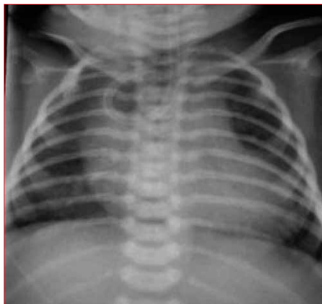
Figure 2: Nasogastric tube in proximal pouch