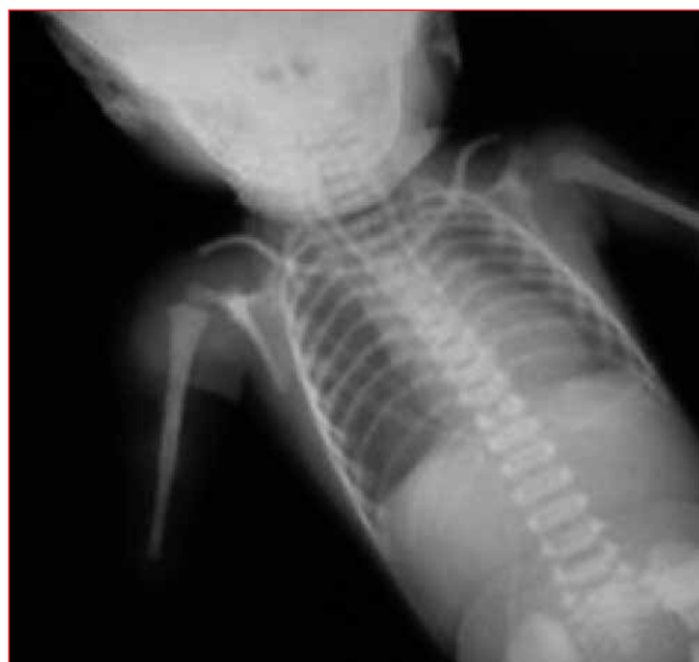
Figure 3: VACTERL (vertebral defects, anal atresia, trachea-oesophageal fistula with oesophageal atresia, cardiac defects, and renal and limb) association airway management

Adhesions with continuous elongations are the main problem with this procedure. In 2000, Dessanti et al modified the Kimura technique by using a Gore-Tex® material wrapped around the oesophagus to prevent adhesions in a 1 kg infant with success. 33 The Collis-Nissen procedure, although still using the oesophagus, involves a gastric pull through into the chest, which presents with similar problems as a gastric transplant. 27 The Collis-Nissen technique was modified and adapted to long gap oesophageal atresia by Aoyama in 1985, with reportedly successful results. 27 Foker described a procedure whereby the