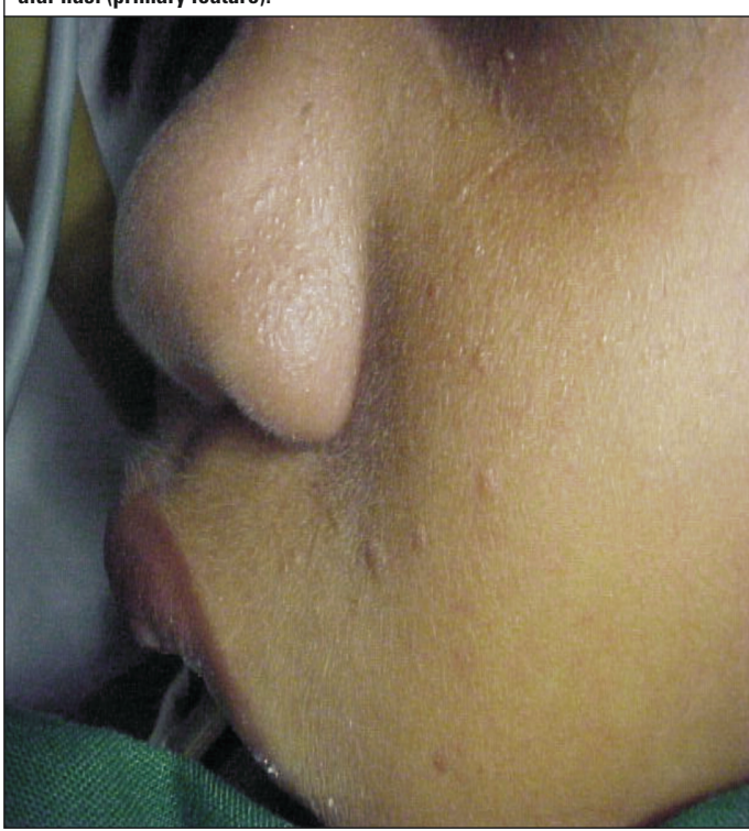
Figure 4: A close up of "adenoma sebaceum" in the malar region close to the alar nasi (primary feature).

operative workup even in asymptomatic patients.