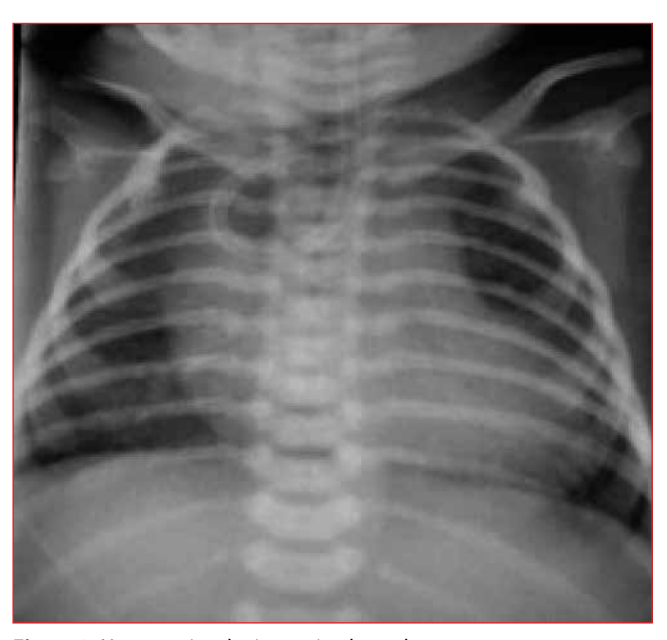
Figure 2: Nasogastric tube in proximal pouch