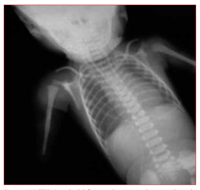
Figure 3: VACTERL (vertebral defects, anal atresia, trachea-oesophageal fistula with oesophageal atresia, cardiac defects, and renal and limb) association airway management

Adhesions with continuous elongations are the main problem with this procedure. In 2000, Dessanti et al modified the Kimura technique by using a Gore-Tex® material wrapped around the oesophagus to prevent adhesions in a 1 kg infant with success.<sup>33</sup> The Collis-Nissen procedure, although still using the oesophagus, involves a gastric pull through into the chest, which presents with similar problems as a gastric transplant.<sup>27</sup> The Collis-Nissen technique was modified and adapted to long gap oeosophageal atresia by Aoyama in 1985, with reportedly successful results.<sup>27</sup> Foker described a procedure whereby the