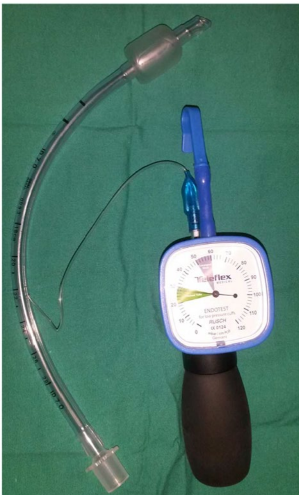
Figure 1: ETT cuff pressure measurement technique.

The median ETT cuff pressure recorded was 36 cm H 2 O (range 10–120 cm H 2 O). The RUSCH Endotest™ manometer could only record up to a maximum of 120 cm H 2 O, therefore pressures higher than 120 cm H 2 O ( n = 4) were recorded as 120 cm H 2 O. The