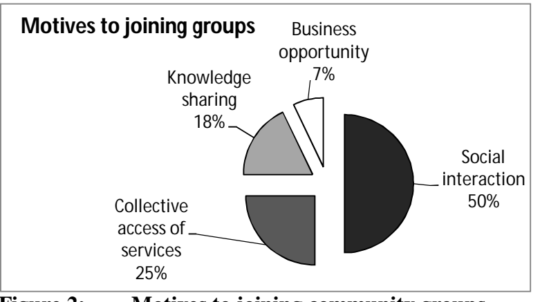
Figure 2:Motives to joining community groups