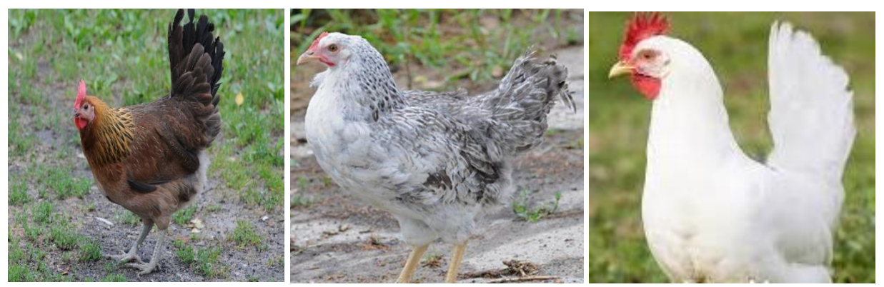
Figure 1 Representative images of the Green-legged partridge, Polbar, and Leghorn laying hens

This research was conducted on three breeds of laying hens, namely Green-legged partridge (Zk), Polbar (Pb), and Leghorn (Lg) (Figure 1). These breeds had been the subject of earlier research (Kozak et al. , 2019a). Green-legged partridge is a native Polish breed that is often found on organic farms. These hens are well adapted to the conditions of extensive free-range farming. Polbar was created by mating Green-legged partridge hens with Plymouth Rock cocks. The breed features of Pb chickens became fixed in the 1950s. Both breeds (Zk and Pb) are kept in closed populations that do not undergo selection, as they are included in a genetic resource's conservation programme. Leghorn, which is one of the most popular layer hen breeds, is especially adapted to intensive breeding and is subjected to intensive selection. The research material consisted of 150 laying hens, including 50 Zk, 50 Pb and 50 Lg. All birds came from the same brood and were 33 weeks old at the time of the behavioural study. All breeds were kept in one building to ensure uniform environmental conditions, in six separate pens on litter, each with 25 hens of one breed. Each pen had a density of 0.3 m<sup>2</sup>/individual bird (Journal of Laws, 2003).