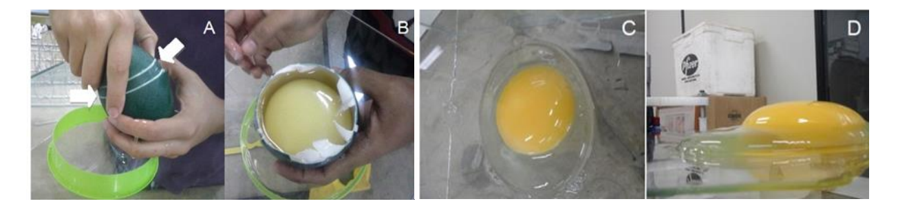
Figure 1 A: Emu egg cut open with a manual saw; B: Egg after breaking the eggshell membranes; C: Overhead view of egg on the glass bench; D: Profile view of egg on the glass bench

The eggs were weighed on a digital balance with 0.01 g precision. After recording the morphometric traits, the eggs were broken on a glass bench for additional assessment. The eggs were sawn carefully around their equatorial circumference while trying to preserve the integrity of the eggshell membrane (Figure 1A). Then these membranes were broken carefully and the contents were deposited on a glass bench, taking care to avoid disruption of the internal structures (Figure 1).