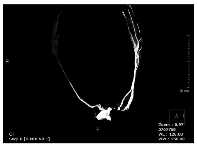
Fig. 3. Computed tomography angiograph showing narrowing and spasm of the right brachial, radial and ulnar arteries.

Jellyfish stings most frequently result in pain, itching, an intense burning sensation and redness in the majority of cases. However, a few studies show that allergic reactions and anaphylaxis are remote complications as the jellyfish toxin is known to act by inducing the release of inflammatory mediators. [10] The classical jellyfish dermatitis, also called seabather's eruption, is believed to occur