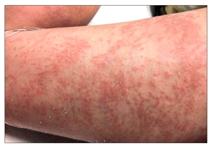
Fig. 2. Papular flagellate rash at the site of attachment of the jellyfish tentacles.

echocardiograph were normal. An ultrasound demonstrated diffuse subcutaneous oedema with moderate knee-joint effusion with septation. Computed tomography angiography showed attenuation in the calibre of the distal two-thirds of the right brachial artery, radial and ulnar arteries and faint contrast opacification (Fig. 3).