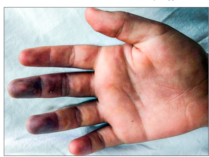
Fig. 1. Digital ischaemia of the fingertips following jellyfish sting.

The right upper limb arterial Doppler showed attenuation of the axillary, brachial, radial and ulnar arteries with a regular colour flow, flow velocities and spectral waveforms with low biphasic resistance and diffuse subcutaneous oedema. The renal artery Doppler and 2D