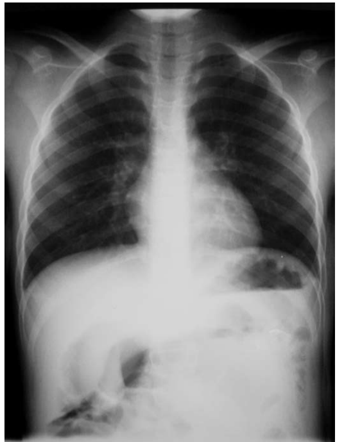
Fig. 1. Erect chest radiograph indicating dilated loops of small bowel extending infradiaphragmatically on the left where the spleen is normally located.

A midline laparotomy revealed the cause of the abdominal pain. A 720-degree torsion of a wandering spleen on its vascular pedicle was found (Fig. 2). The spleen was enlarged, firm and