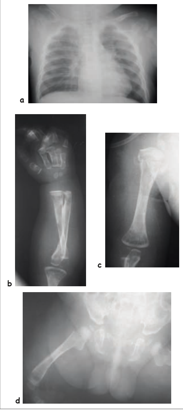
Fig. 1. a: chest radiograph, anteroposterior view with no radiological signs of pulmonary TB; b: anteroposterior radiograph of the right humerus with pathological fracture through the lytic lesion in proximal metaphysis with callus formation; c: the right radius and ulna show metadiaphyseal involvement with lytic lesions; d: radiograph of the pelvis including the right femur showing similar metaphyseal involvement.

regional and/or distant lesions, a chest radiograph, sputum specimen microscopy, mycobacterial blood culture, bone marrow biopsy, urine culture and other systemic investigations as clinically indicated.<sup>1,5</sup>