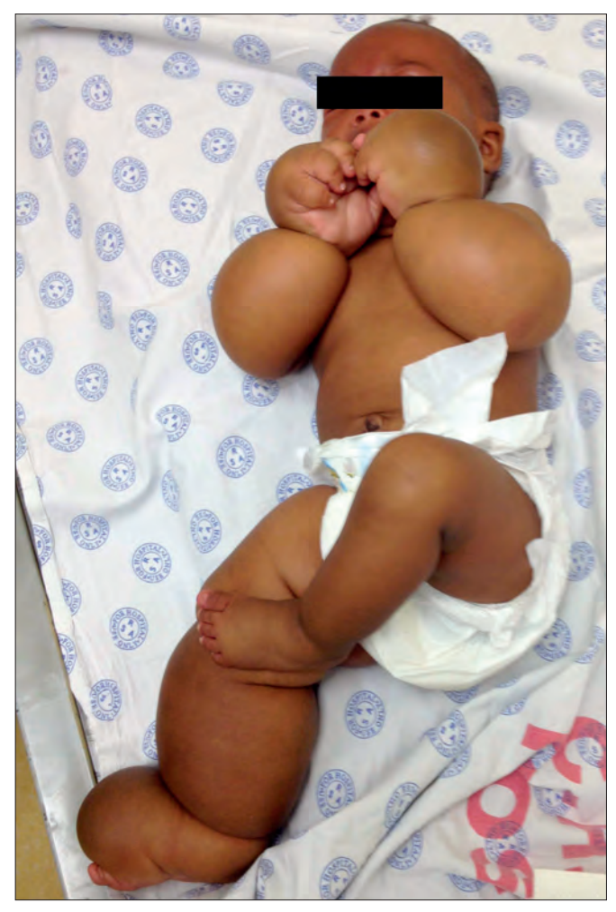
Fig. 1. Infant with lymphoedema of both upper limbs and right lower limb (reproduced with permission from the parents).