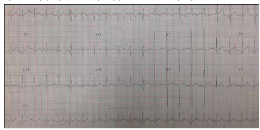
Fig. 2. ECG at convalescence showing sinus rhythm with heart rate of 139 bpm.

to financial constraints. The mother of the patient was not screened for subclinical lupus.