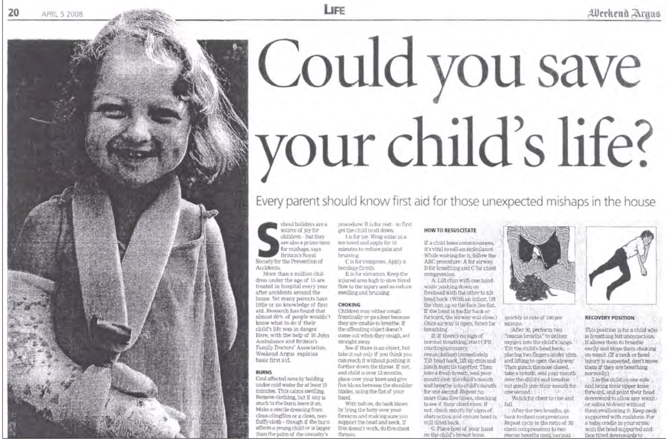
Fig. 3. An educative article focusing on first aid for parents.