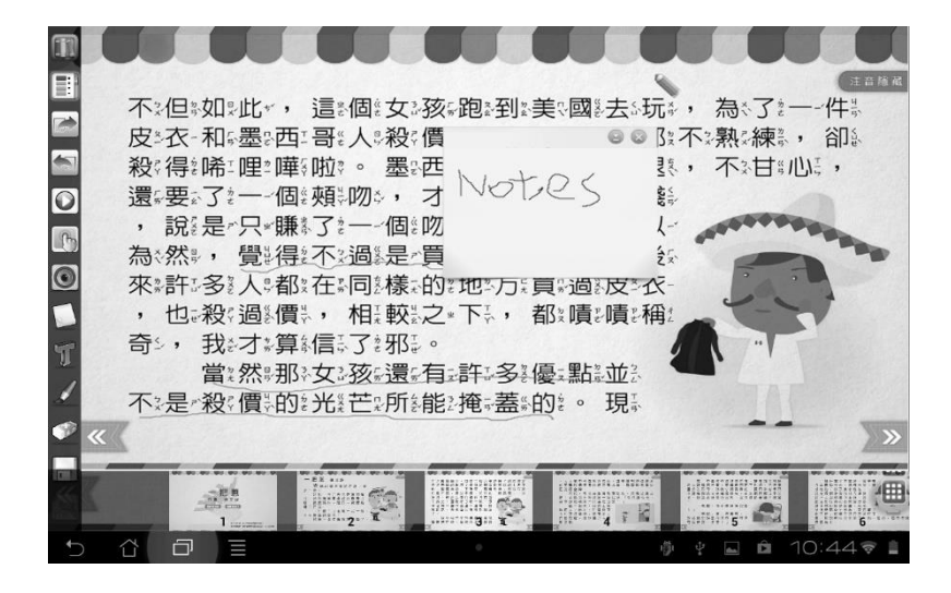
Figure 1 The e-book interface

them offline. The management system recorded students' notations during use of the interactive tools. We provided two versions of each e-book (with and without phonetic notation) for students with different reading proficiencies (Figure 2).