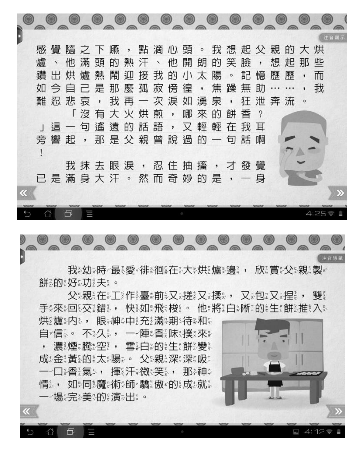
Figure 2 E-book pages with (top figure) and without (bottom figure) phonetic notation