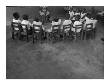
Figure 1 Seating arrangement

The teachers understood from the participatory action research that they needed to be creative, that they could create their own stories that would help them teach specific curriculum concepts: "... sometimes I am even tempted to create my own story ... because I know that through that the children learn a lot."