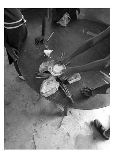
Figure 7 Roleplay

The teachers asserted that when indigenous folktales and games were used to teach curriculum concepts, children learned more concepts, and the development of other aspects such as language,