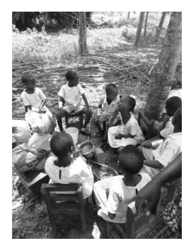
Figure 6 Dramatisation

In Figure 6 the children are dramatising a forest scene from the story the teacher had narrated to them earlier in the classroom. Figure 7 shows children roleplaying making supper.