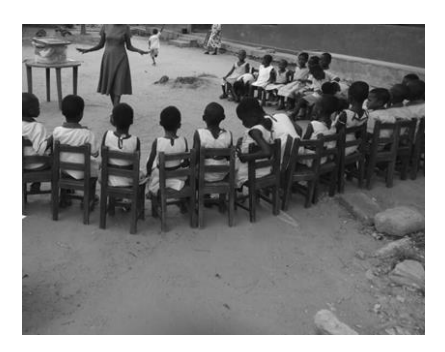
Figure 2 Use of outdoor space

Figures 1 and 2 confirm the teachers' acquisition of knowledge, shown in the way that they arranged their classrooms during lessons, and how they used outdoor spaces.